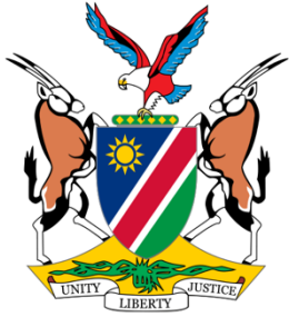
Republic of Namibia